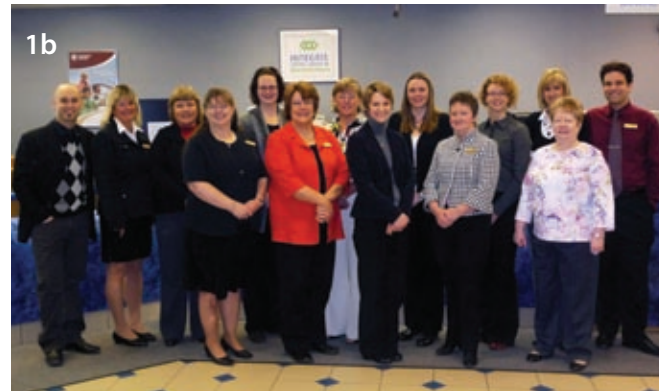
Town Centre Branch Administration Staff