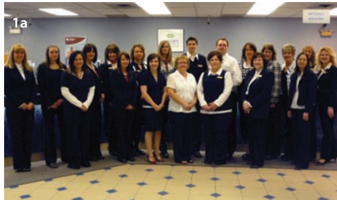
Town Centre Branch Staff

For more information, visit our website www.integriscu.ca