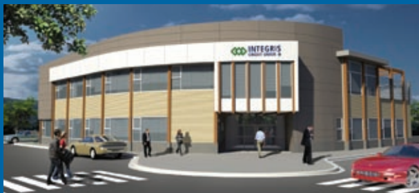
Architectural rendering of the new Integrus Credit Union Vanderhoof Branch — slated to open in 2011.